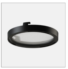
code L085E.A uncategorized. Black finishing

code L085E.A uncategorized. White finishing