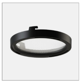
code L085A.A uncategorized. Black finishing

code L085A.A uncategorized. White finishing